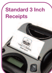
Standard 3 Inch Receipts