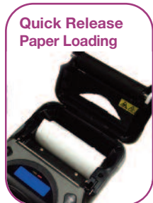
Quick Release Paper Loading