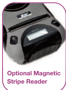
Optional Magnetic Stripe Reader