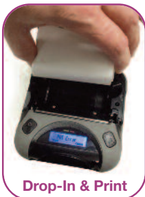
Drop-In & Print